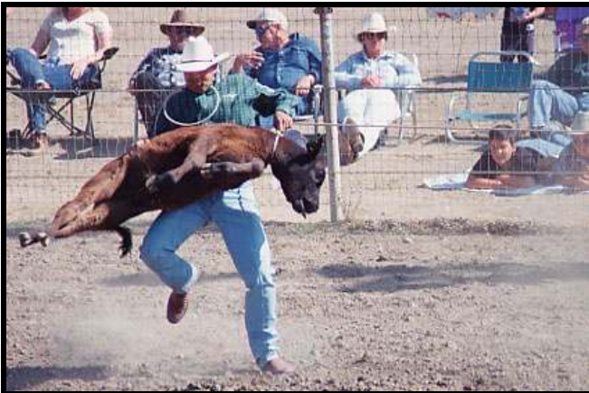
Calf being choked for human entertainment during a rodeo.

Other animals at rodeos are physically dominated for human entertainment. Other animals exploited for testing are shocked, burned, and purposely infected with disease.