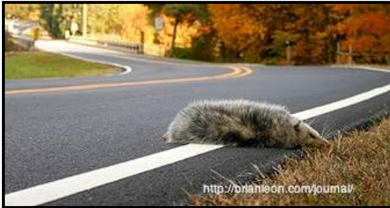
This possum has been killed by a human-driven vehicle.