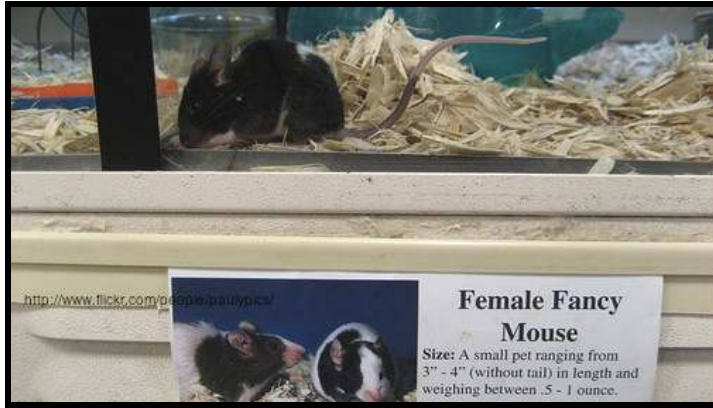
A mouse who is destined to become a human's property.