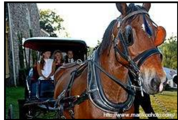
This horse has been forced into a life of serving humans.

Forced labor is a result of our choice to exploit other animals. We believe they exist to serve us, so we make them serve us.