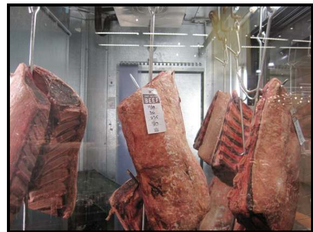
Supermarket display showing pieces of killed cattle.

Killing is a result of our choice to exploit other animals. To 'harvest' the bodies we want – and remove the bodies we don't – we end the lives of countless individuals.